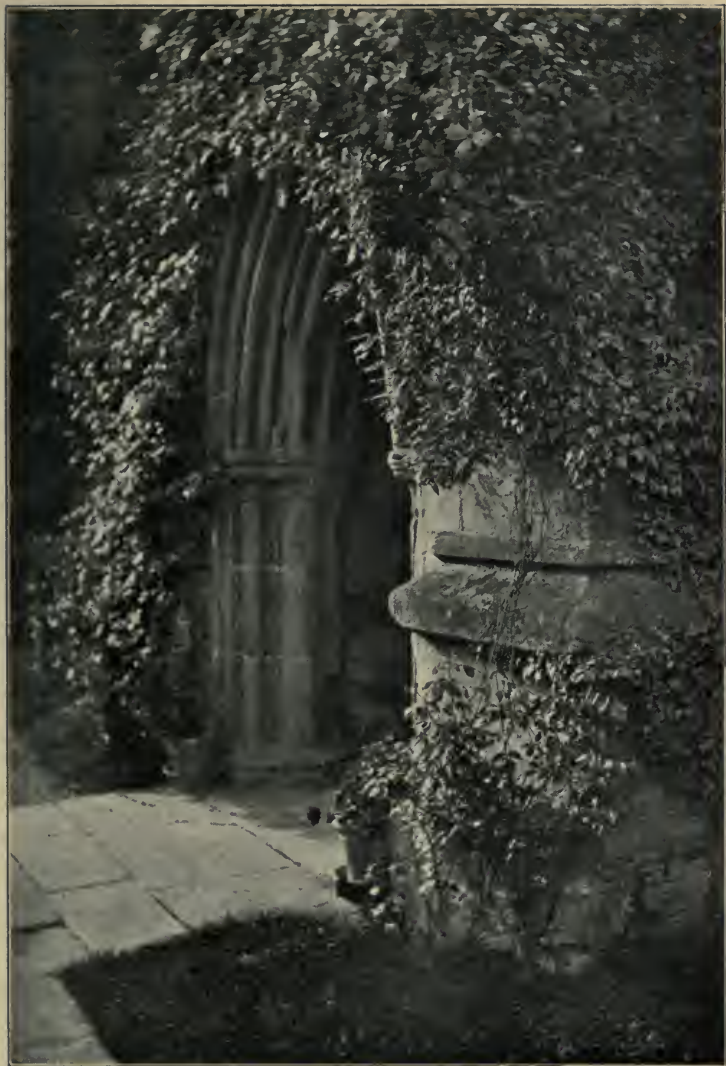
'BUT I MAY PASS THE OLD CHURCH DOOR'